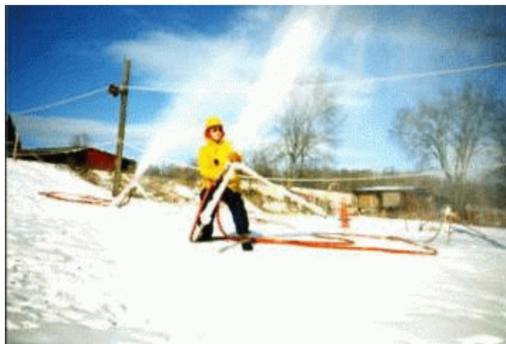
Figure IV-19: Water used for snow making at Ski Windham accounts for 55% of total average water use in the watershed.

In his study of the groundwater relationships in the Batavia Kill, Hesig reported that many of the tributaries exhibit infiltration losses as they reach the stratified, permeable materials found at the fringe of the Batavia Kill against the valley walls (1999). This infiltration is