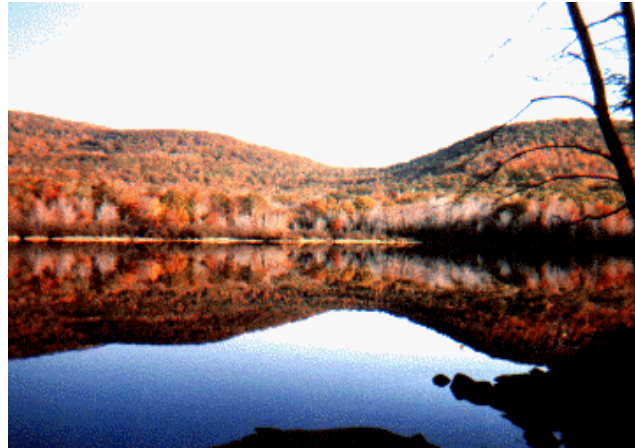
Figure IV-18: Local water resources such as Lake Heloise at the White Birch Campground are important to the economy in the watershed

In addition to the Batavia Kill, the watershed also includes numerous small lakes and ponds which are important as recreational and habitat resources. The principal uses of these surface waters include fishing, snow making, and private recreation such as swimming. These surface waters also are a water supply for NYC. The permanent pool at the C.D.Lane flood control structure is a 26 acre impoundment managed by the Town of Windham for recreational activities. The facility has a public beach. This lake is also managed by NYSDEC as a trout fishery with rainbow and brook trout stocked annually, and with a boat launch site maintained at the facility. At the Mitchell Hollow flood structure (Mad Brook), a smaller, shallower permanent pool behind the dam is characterized by excellent wetland habitat conditions.