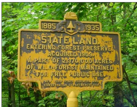
State Land historical marker

The entire East Kill watershed lies within the Catskill Park. The Catskill and Adirondack Forest Preserves were established by the NYS Assembly in 1885. An 1894 amendment to the New York State Constitution (now Article 14) directs: "the lands of the State now owned or hereafter acquired, constituting the forest preserve as now fixed by law, shall be forever kept as wild forest lands. They shall not be leased, sold or exchanged, or be taken by any corporation, public or private, nor shall the timber thereon be sold, removed or destroyed (NYS DEC, 2006)."