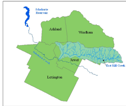
Figure 2.1.2 East Kill watershed towns

A dominant characteristic of the East Kill watershed's regional setting is its location within the 2,000 square-mile New York City Watershed. The NYC Watershed is the largest unfiltered water supply in the U.S., providing 1.4 billion gallons of clean drinking water each day to over nine million residents in New York City and some smaller municipalities (nearly half the population of New York State) (Catskill Center 2 , 2006).