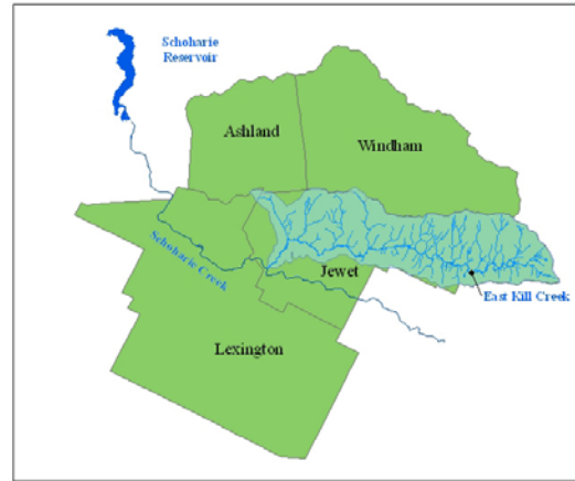
Figure 2.8.1. East Kill watershed

Land cover of the East Kill Watershed was analyzed using the LANDSAT ETM 2001 geographic information system (GIS) coverage created by the New York City Department of Environmental Protection (DEP) (Figure 2.8.1). The categories are comprised of 47 different classification descriptions. To simplify the data, land cover classifications have been grouped together and re-classified to convey the general land cover category that each classification falls