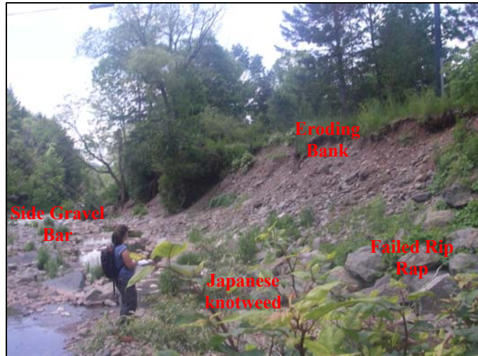
Schoharie/East Kill Project Team Member assesses a stretch of Schoharie Creek as part of 2006 walkover.

This stream feature inventory was also used to help define and prioritize further assessment, and scope the issues to be addressed in the management plan. Most of the data presented in the Management Unit Descriptions in Section 4 was derived from the stream feature inventory walkover conducted during the Summer of 2006. The Trimble GeoXH Global Positioning System (GPS) was used to map locations of features described above. Photographs and attribute data were also taken at each feature. Protocol used for attribute collection is detailed in Appendix F, Stream Management Data Dictionary Guide.