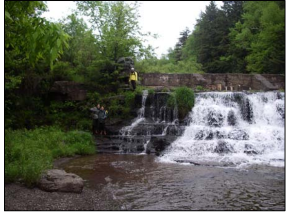
Schoharie/East Kill project team near a dam in the upper Schoharie

A watershed assessment protocol was prepared to support the development of the Schoharie and East Kill Stream Management Plans. The protocol was meant to provide the project team with a general baseline inventory of conditions throughout the stream corridor.