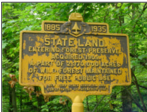
Figure 2 State Land historical marker

In 1904, the Catskill Park was designated, establishing a boundary or 'blue line' around the Forest Preserve and private land as well. Over the years the Catskill Park grew, and now comprises roughly 700,000 acres, about half of which is public Forest Preserve. The Catskill and Adirondack Parks are nationally unique because they are a checkerboard of public and private land; a grand experiment in how nature and human society can coexist in a landscape. 2