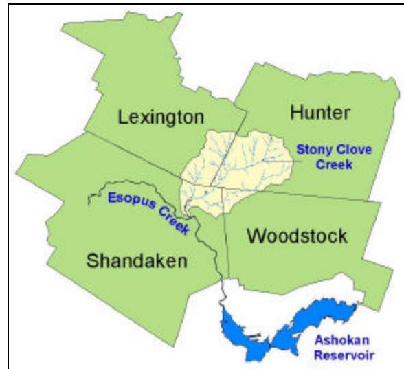
Figure 3 Stony Clove Creek watershed town boundaries

The NYC Department of Environmental Protection (DEP) operates this drinking water supply under a Filtration Avoidance Determination (FAD) issued by the Environmental Protection Agency (EPA) and the New York State Department of Health. Central to the maintenance of the FAD are a series of partnership programs between NYC and the upstate communities, as well as a set of rules and regulations administered by the DEP. 4